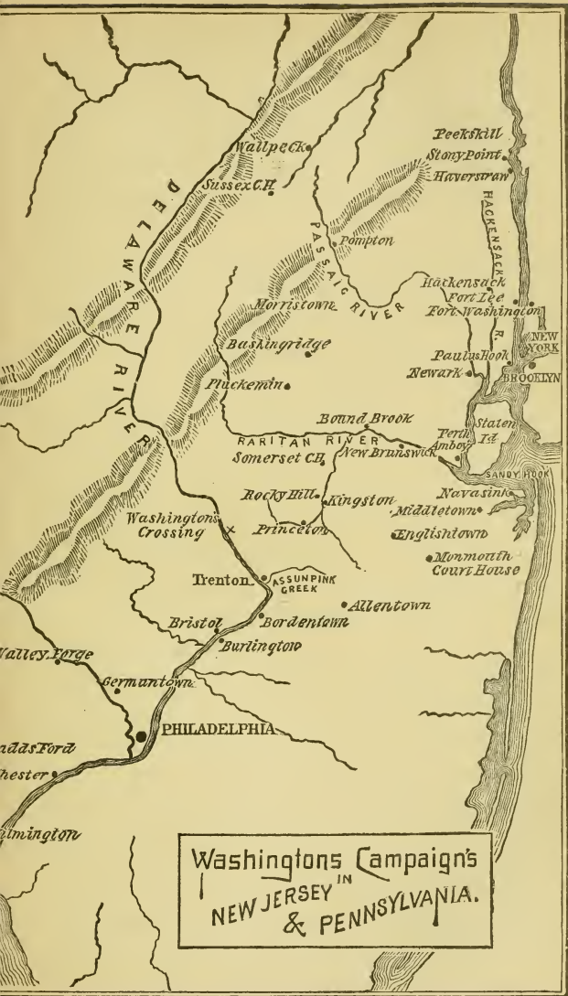
Washington's Campaigns NEW JERSEY IN & PENNSYLVANIA.